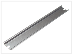
DIN rail, 26 cm for TA342912