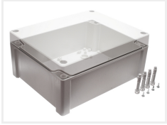
Transparent lid, 289 x 239 x 107 - TPC29241IT

SKU 660606T Dimensions: 107 x 239 x 289mm