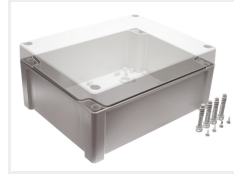
Transparent lid, 344 x 289 x 117 - TPC342912T

SKU 660603T Dimensions: 117 x 289 x 344mm