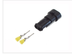
Male, 2 pins