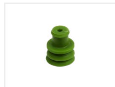
Loose parts, Seal Green 1.2 - 1.6mm