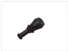
Rubber base, 1 positions