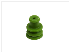
Loose parts, Seal Green 1.2 - 1.6mm