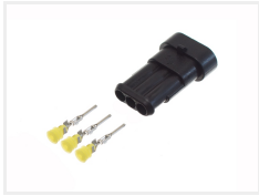
Male, 3 pins