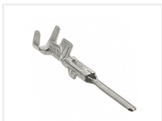
Loose parts, Male terminal 0.75 - 1.5mm 2