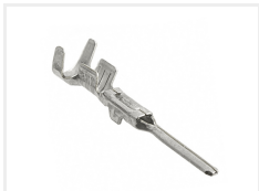
Loose parts, Male terminal 0.75 - 1.5mm 2