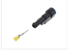
Male, 1 pin