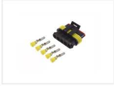
Female, 5 pins