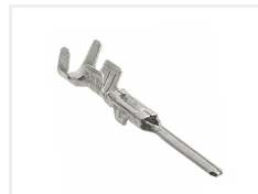
Loose parts, Male terminal 0.75 - 1.5mm 2