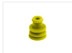
Loose parts, Seal Yellow 1.8 - 2.4mm