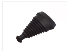
Rubber base, 5 positions