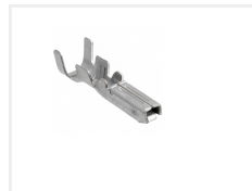
Loose parts, Female terminal 0.75 - 1.5mm 2