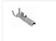
Loose parts, Female terminal 0.75 - 1.5mm 2