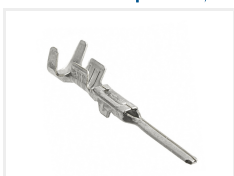
Loose parts, Male terminal 0.75 - 1.5mm 2