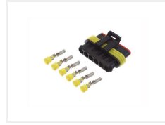
Female, 6 pins