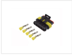
Female, 5 pins