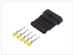
Male, 5 pins