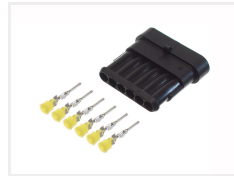
Male, 6 pins