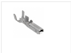
Loose parts, Female terminal 0.75 - 1.5mm 2