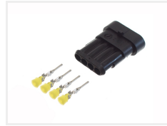
Male, 4 pins