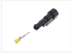
Male, 1 pin