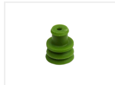
Loose parts, Seal Green 1.2 - 1.6mm