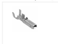
Loose parts, Female terminal 0.75 - 1.5mm 2