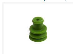
Loose parts, Seal Green 1.2 - 1.6mm