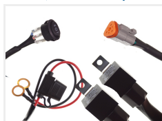
12V, 1 x 3-pin Deutsch DT stik