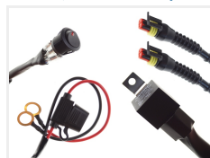
12V, 2 x 2-pin Superseal I.5 plug