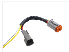
Accessori, Adapter cable - 4-pin to 2-pin