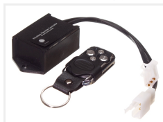
Accessory, Remote control