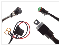
12V, 1 x 2-pin Deutsch DT plug