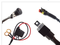
24V, 1 x 2-pin Superseal I.5 plug