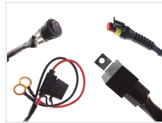
12V, 1 x 2-pin Superseal I.5 plug