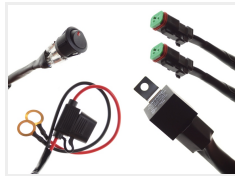
12V, 2 x 2-pin Deutsch DT plug