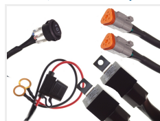
12V, 2 x 3-pin Deutsch DT stik