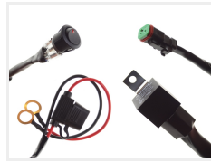
24V, 1 x 2-pin Deutsch DT plug