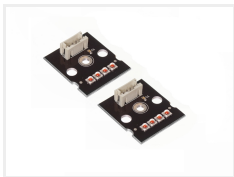
2015-2020, American (only orange)