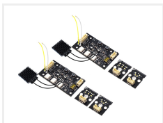
2015-2020, Dual Color Yellow/White