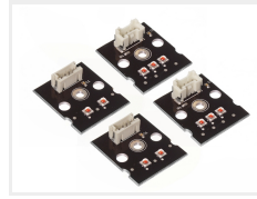
2015-2020, Warm white