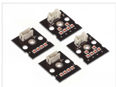
2012-2015, Warm white American