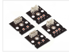
2015-2020, Warm white American