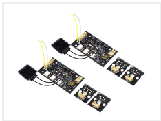
2015-2020, Dual Color Yellow/White