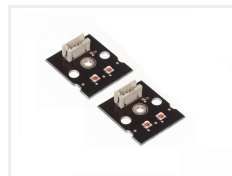
2012-2015, American (only orange)