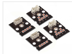
2012-2015, Xenon White