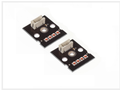
2015-2020, American (only orange)