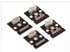
2012-2015, Warm white