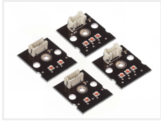
2015-2020, Xenon white