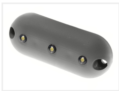
Grey, 5 m