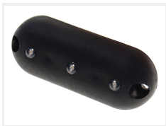
Black, 5 m