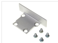
Accessories, 1 end cap