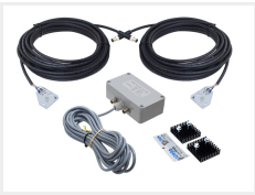
Dual Color Amber/White + Strobe