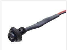
Black, Cool White