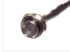
Chrome, Cool White