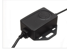
24V Canbus Kit, H7