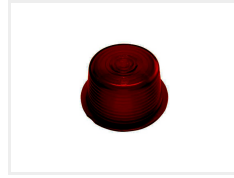
Glass, Smoked red