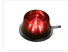
LED unit, Smoked red