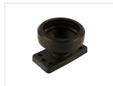
Rubber base, Y-model