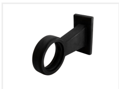
Rubber base, Straight