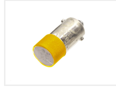
Bulb, 24V Yellow