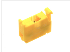
Accessory, Indikator-block (required)