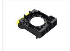
Accessory, Coupling (required)