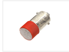
Bulb, 230V Red