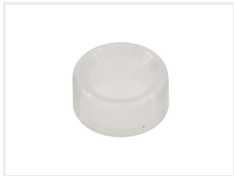
Accessory, Rubber protection