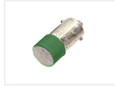
Bulb, 12V Green