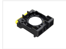
Accessory, Coupling (required)