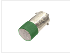
Bulb, 24V Green