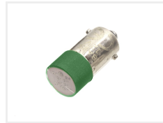
Bulb, 230V Green