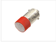
Bulb, 24V Red