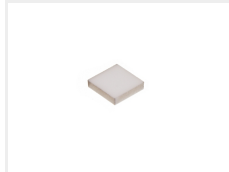
Mounting, Tape - 3M VHB (15x15x3mm)