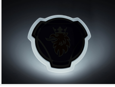
Dual Color Yellow/White