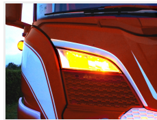
Dual Color Amber/Warm white