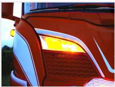
Dual Color Amber/Xenon white