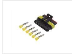
Female, 6 pins