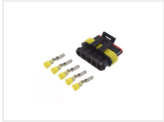
Female, 5 pins