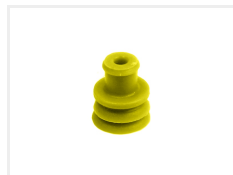
Loose parts, Seal Yellow 1.8 - 2.4mm