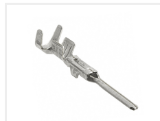
Loose parts, Male terminal 0.75 - 1.5mm 2